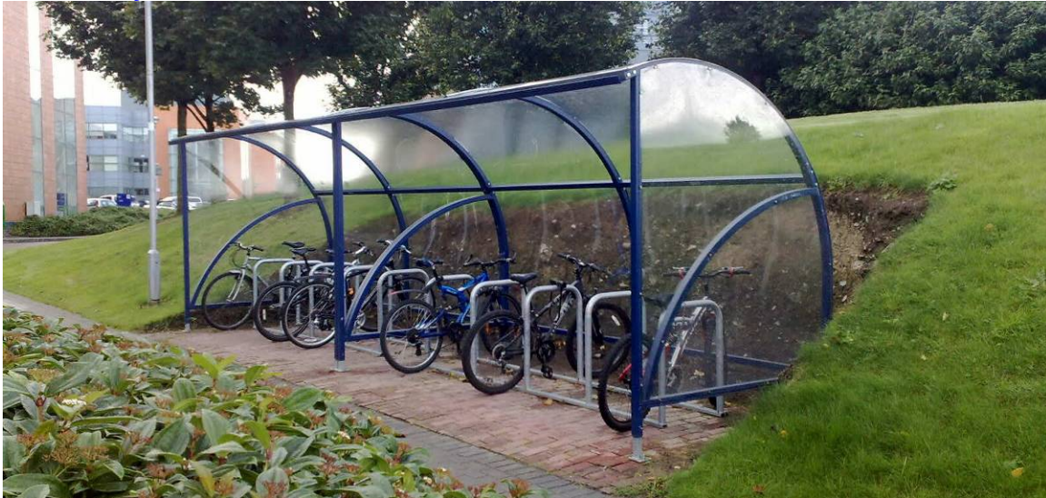
20 Cycle Curved Shelter with toastracks and optional painted finish.