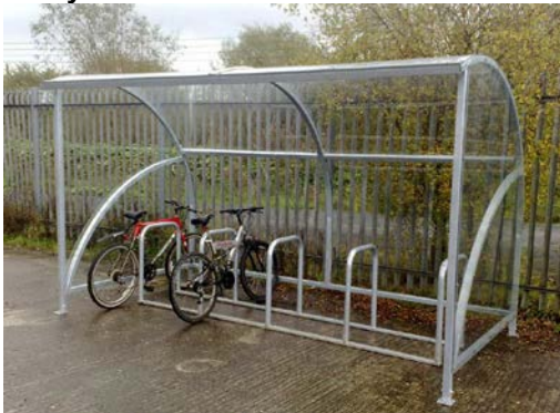
10 Cycle Curved Shelter with toastrack.