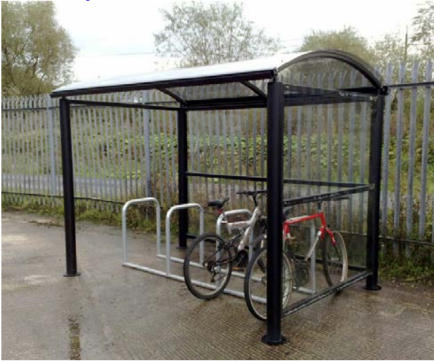
10 Cycle with toastrack